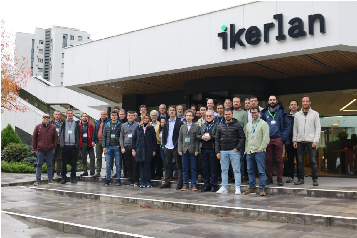
The NimbleAI team perceived in event-based vision